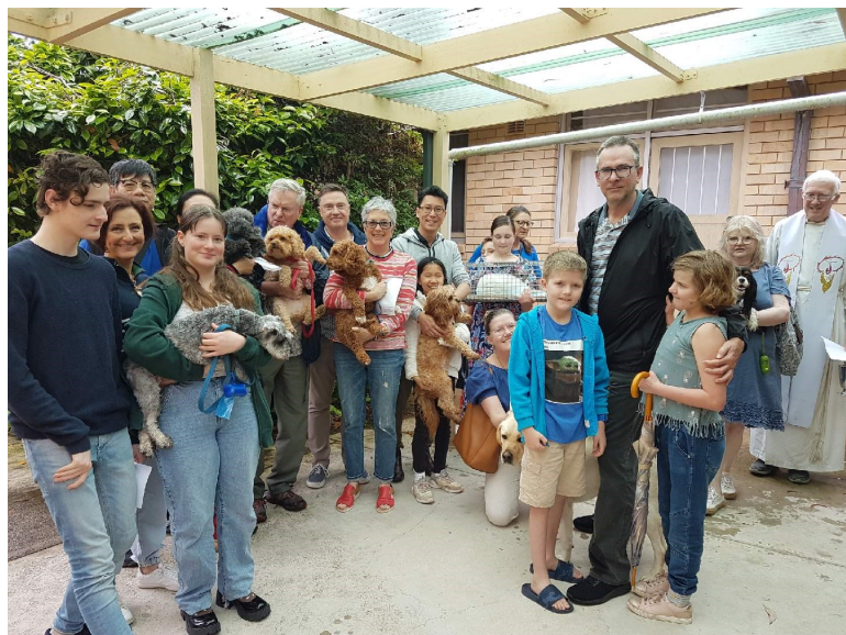
Blessing of animals last Sunday at Killara

M: 0412 256 616 E: chris.iacono@bigpond.com